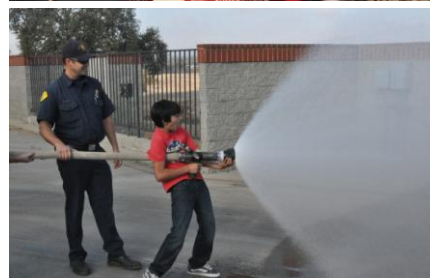
The Fire Station – thank you, S.B. County Engine 32 and Los Padres National Forest!