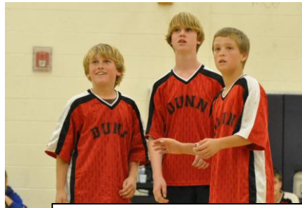
A team beats Los Olivos