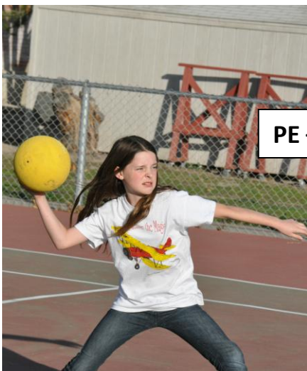
PE – dodge ball