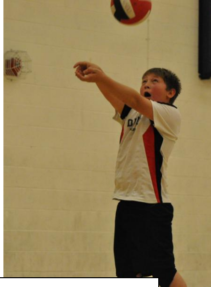
B team beats Solvang