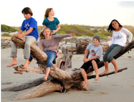
Right: Hike Club explores the trestle bridge.