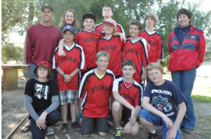
Above: Boys' volleyball Teams, 2011.