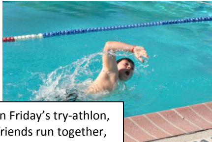
In Friday's try-athlon, friends run together, swim together, and bike together.