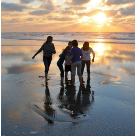
Above and Below: Hike Club – at the beach.