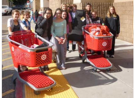
Above: Club Interact buys clothes and toys for a local family in need. They raised enough money to buy $70 of goods for each of seven people in the family!