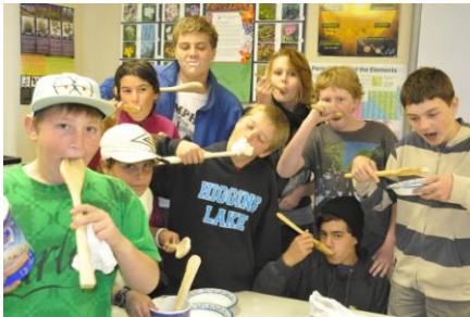
Above: Shop class tests out their homemade wooden spoons!