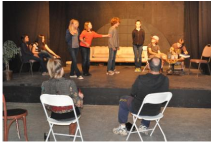
Above: Theater class has been working in the barn all week. Below: Students find themselves juggling many different things in Human Tricks and Stunts.