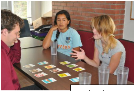
In the classroom: cards, motion detectors, surface area-volume ratios, and fun!