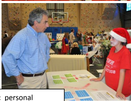
Hero Festival: personal heroes, historical heroes, and fictional heroes.