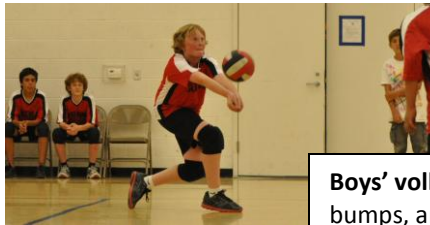
Boys' volleyball: bumps, bumps, and lots to learning.